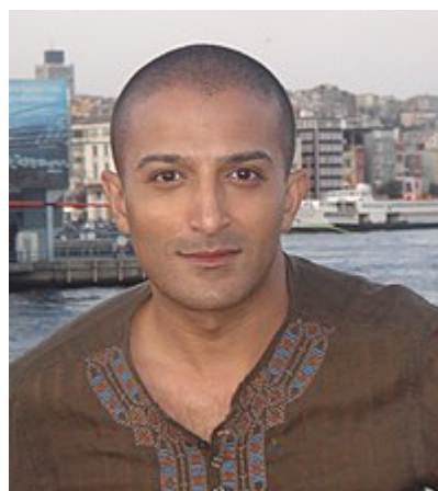
Adil Ray in Turkey , 2012