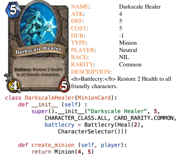
Figure 3: A example of the implement of HearthStone.

p_g is the probability of using the type of predefined rules, and the p(r_i|\cdot) (the probability of each predefined rules) are computed by two single-layer perceptrons with the sigmoid and softmax activation functions, respectively, and the input of these layers are the features h^{(dec)} .